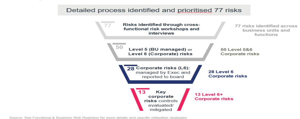
Key risks have been identified & controlled in 12 functional & business risk registers

The Risk Committee actively manages and works to mitigate 28 key corporate risks (including 13 high level risks) via 12 separate risk registers.